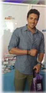
Zack Kalter TV Personality