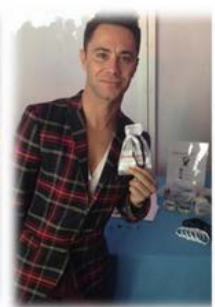
Dancing With The Stars