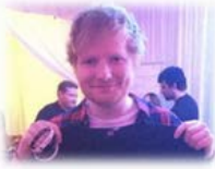
Ed Sheeran Singer