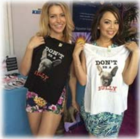
Lindsay Taylor+ Janel Parrish Pretty Little Liars TV show