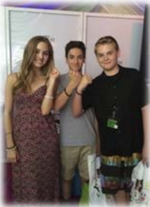
Ella Wahlestedt Teo Halm Reese Hartwig Actress / Actors