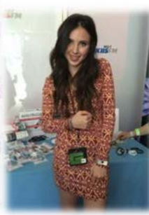
Ryan Newman Nickelodeon Star