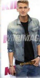
Cody Simpson Singer