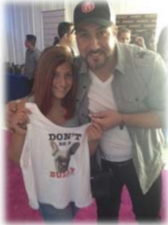
Joey Fatone Nsync